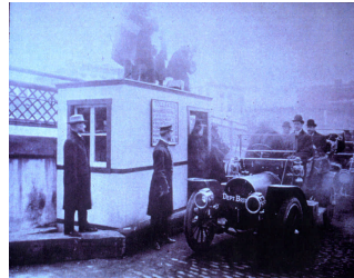
Historic toll plaza of Queensborough Bridge

So, not only do I say restore two-way tolls at the Verrazano Bridge, but EZPass all the East River bridges. And integrate the toll structure among the many authorities so that it is always more expensive to travel through Manhattan than around it. In fact, all four East River bridges were tolled until 1911