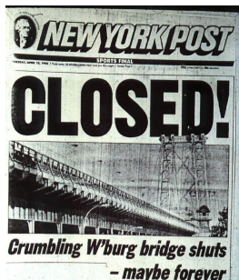
New York Post front page. April 13, 1988.

EZPass has shown that we can significantly diminish queuing dismissing that argument.