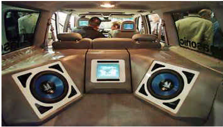
Mobile multimedia and coming soon: the Spa in a car!

Over the past five years cars have again grown bigger and roomier, with ergonomic interiors, phones, faxes, computers, televisions, DVD and VCR players, in-vehicle navigation devices and superb sound systems. Coming soon are variable messages you can send to nearby cars, perhaps a way of matchmaking, traffic periscopes to tell you what's up ahead, massage chairs and more. No wonder more and more people are willing to tolerate worsening congestion; the car is probably their most relaxing and fulfilling space and time. I'll bet soon some sharp advertising company will refer to their latest model as the "spa in a car."